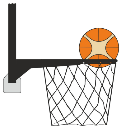
Diagram 3 Ball is within the basket

31-18 Example: A1 attempts a shot for a field goal. While the ball turns around the ring and its slightest part is within or below the level of the ring B1 touches the ball.