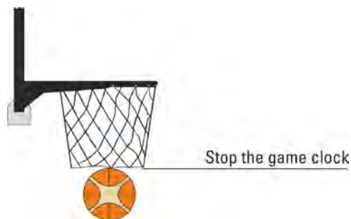
Diagram 1 A goal is scored

16-10 Example: At the begin of a quarter, team A is defending its own basket when B1 erroneously dribbles to his own basket and scores a field goal.